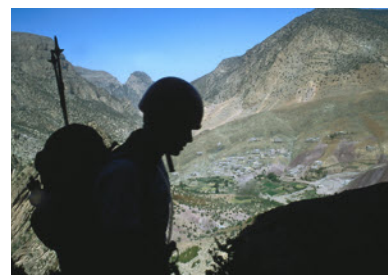
There is plenty on offer over the next year or so. Courses for beginners right through to the most experienced amongst us. Don't be afraid to try something new!