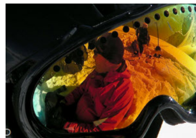
Remember its not only walking and water that is available. Every year LNR ACF goes on Exercise Ski Cadet. This year we will be spending a week in Italy.

There are plenty of courses and weekends available for you to experience the diversity of what adventurous training can offer - all at a very low cost. Read through this bumper first issue carefully as it is packed with courses for the next 15 months. Why not try something new!